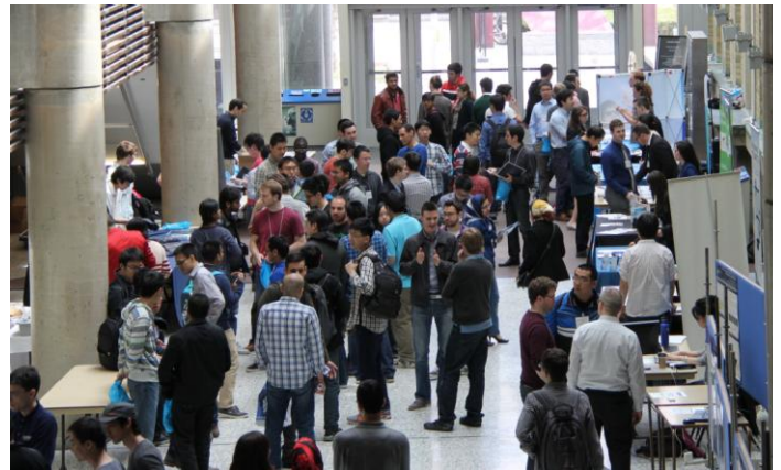
Industry booth and student poster session at the Bahen Centre for Information Technology, Connections 2014 .

learn about industry partnerships and resources available at U of T to aid network development and entrepreneurship. Breakfast, lunch and refreshments are provided for all participants (usually totalling between 150 and 200 individuals), and the event concludes with a networking dinner banquet (75-100 individuals) hosted at the Hart House.